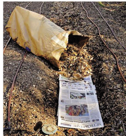
Figure 5. After digging a hole or trench, fill it with newspapers and dry leaves.