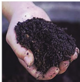
Figure 3. Humus ready for use in the garden.

As microorganisms begin to break down the organic material, heat is generated. Within a few days the compost pile should reach an internal temperature of 90 to 160 degrees F. This process will destroy most weed seeds, insect eggs, and disease organisms, producing rich, soft humus or compost (Fig. 3).