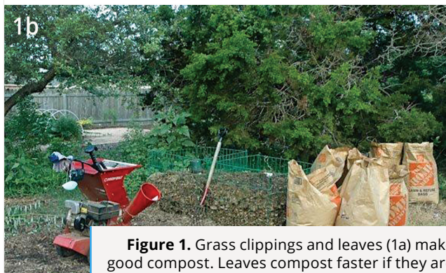
Figure 1. Grass clippings and leaves (1a) make good compost. Leaves compost faster if they are shredded before being added to the pile (1b).