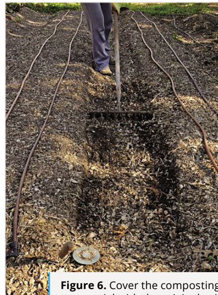
Figure 6. Cover the composting material with the original soil from the hole or trench.