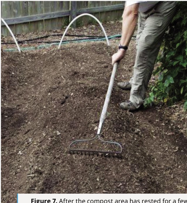
Figure 7. After the compost area has rested for a few months, turn the soil. It is ready to be used for planting.