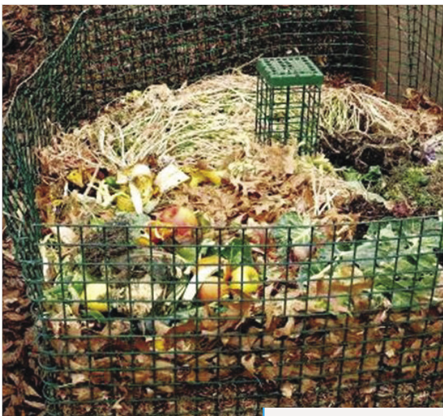
Figure 4. Compost bins.

Turn the pile weekly during the summer and monthly during the winter to increase the rate of decomposition. About 90 to 120 days are required to prepare good compost using the layer method. If you have room, make three piles so you will have one ready to use, one being tilled, and one being filled up (Fig. 4).